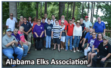
Alabama Elks Association

We love having visitors each summer! Here are a few of the organizations and individuals that stopped by to visit this year.