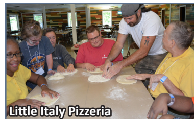
Little Italy Pizzeria