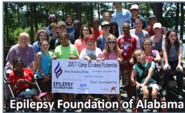
Epilepsy Foundation of Alabama