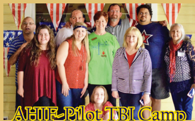
AHIF-Pilot TBI Camp

There are 8 new t-shirts & 4 new hats this year at Camp ASCCA! T-shirts are $15 each or two for $25. Hats are $20 & up!