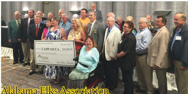
Alabama Elks Association