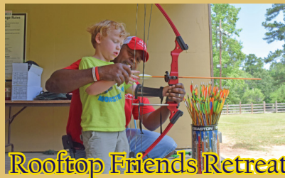
Rooftop Friends Retreat