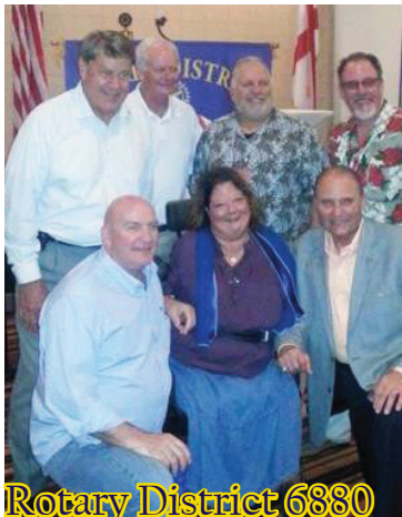
Rotary District 6880