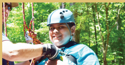
Autism Society Family Camp