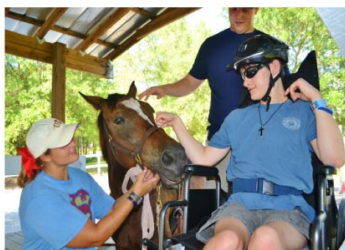
EASTER SEALS CAMP ASCCA