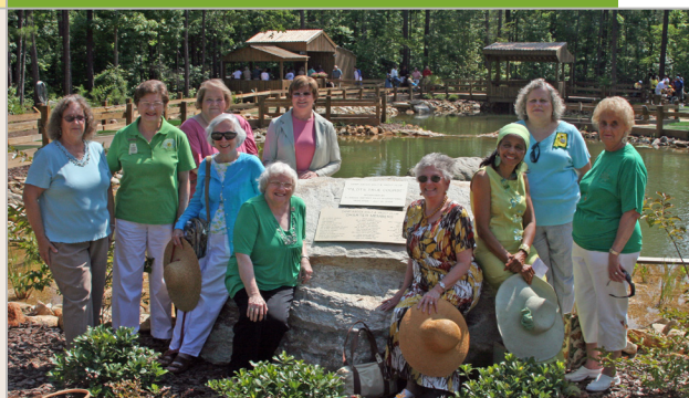
Pilot Club members from throughout the state of Alabama visited Camp ASCCA several times this summer. One group is shown here at the dedication and grand opening of the accessible mini-golf course.

Thank YOU to all of our friends and donors who contributed in response to our newsletter appeals - the response was truly amazing! We have many more camperships, new bedding, gas in the tank for lakefront activities, a splash pad, and a new accessible Golf & Yacht Club! Many of you have gone over-and-above your usual support and you are appreciated.