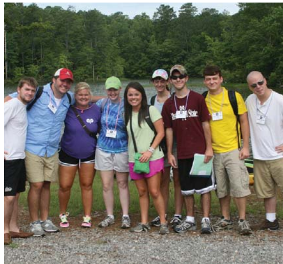
A few summer staff members during Orientation

Each year, the excitement of summer camp reminds us of the thousands of children and adults whose lives our mission and programs have already touched. We invite you to visit www.campascca.org to see many of the