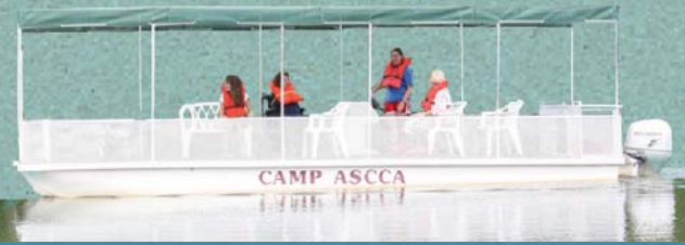
Look at the newly refurbished "Pilot Queen" Pontoon Boat!