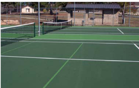
Newly reonvated accessible tennis courts.