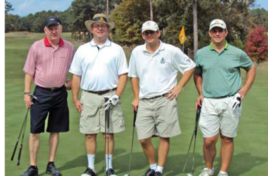
The Haynes Downard LLC accounting firm team from Birmingham.

Visit Camp ASCCA on Flickr.com to view pictures from the day!