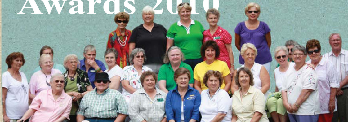
Members of Alabama District Pilots on "Pilot Day" 2010!