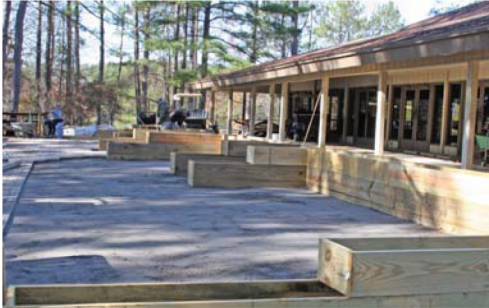
Porch Area outside the Dining Hall.