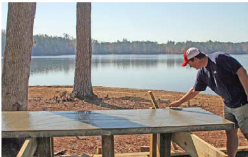
Ping Pong table at the Outdoor Gameroom area.