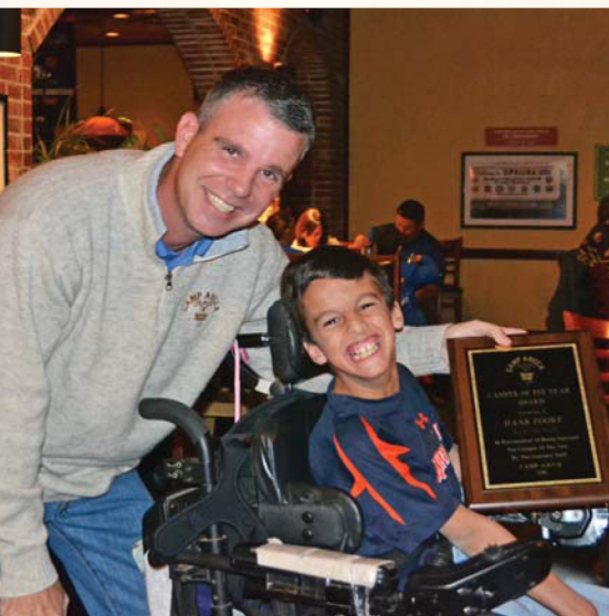
Camper of the Year.