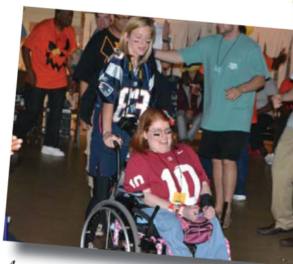
A camper and a volunteer counselor enjoy the Halloween Dance at Camp ASCCA's Fall Weekend!