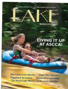
Lake Magazine featured Camp ASCCA!