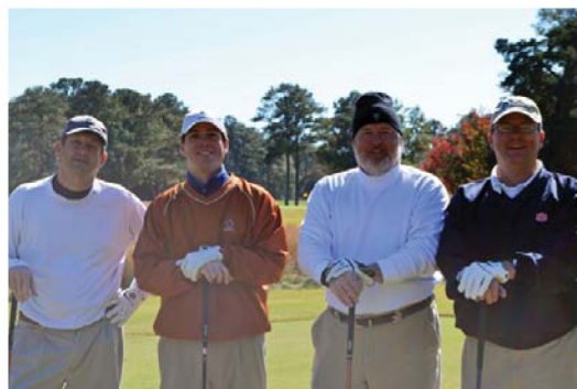
Players from Haynes Downard LLC played on a Camp team!