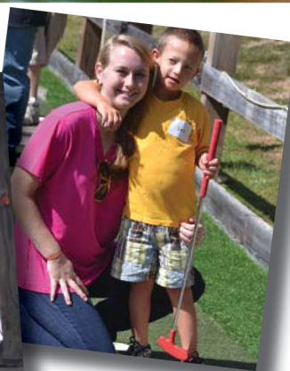
Students and volunteers from Dadeville Schools Special Education classes enjoyed a fun-filled day at camp!