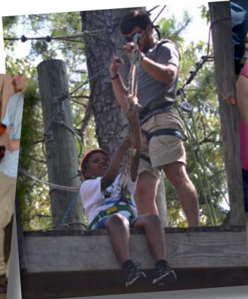
A camper gets ready to go down the zip-line at the Autism Society's Fall Family Camp!